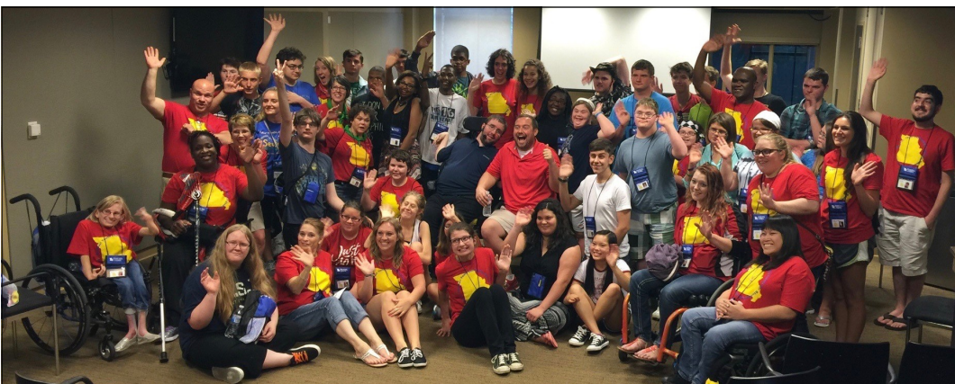
Photos: 2016 MO-YLF delegates and staff inside the Governor's Office (top) Delegates and staff in meeting room on MU campus (bottom)

We are looking forward to next year's MO-YLF already.